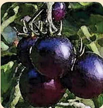
HELSING JUNCTION BLUE