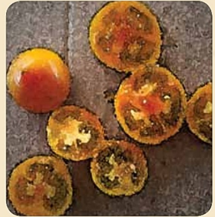
BIG SKY BRANDY